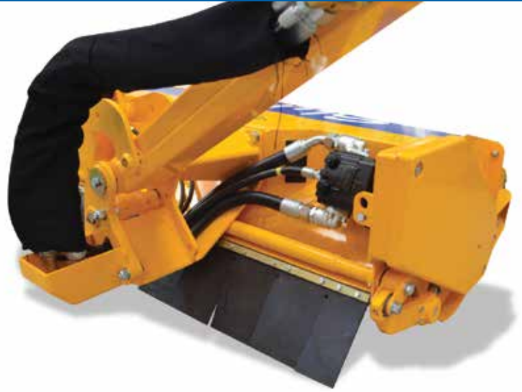
1.2M INBOARD BELT DRIVE HEAD WITH OPTIONAL HYDRAULIC HEAD ROLLER