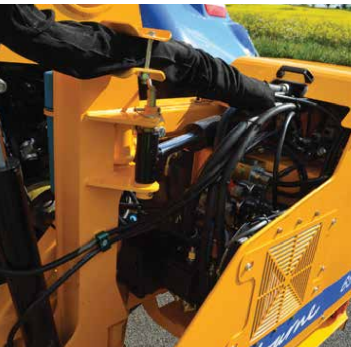
OPTIONAL OIL COOLER