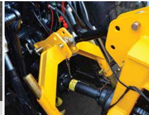
3 POINT STABILISER FRAME