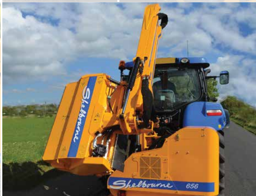
656 IN TRANSPORT POSITION