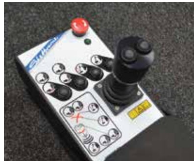
ELECTRONIC PROPORTIONAL JOYSTICK CONTROL INC. SEAT MOUNTING SYSTEM